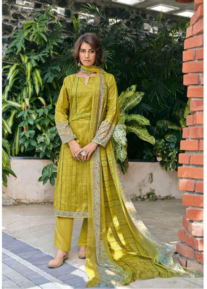
BY THE PATTERNS & VIBRANT COLORS OF POISONOUS YET BEAUTIFUL CREATURES