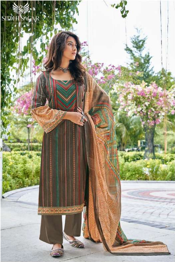
LUXE FABRICS, BOLD PATTERNS & SUMPTUOUS DETAILING ADORN MODERN SILHOUETTES