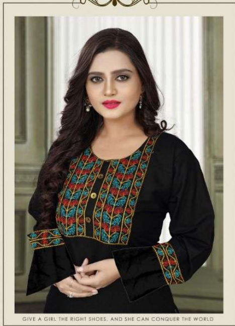
GIVE A GIRL THE RIGHT SHOES, AND SHE CAN CONQUER THE WORLD

10 C elebrate Style in this Summer season