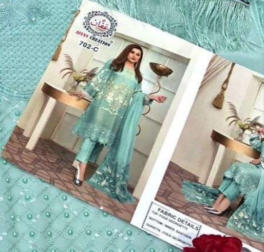
FABRIC DETAILS: TOP: PALE GEORGETTE BOTTOM: IBBELI SATOON DUPATTA: FINE GEORGETTE