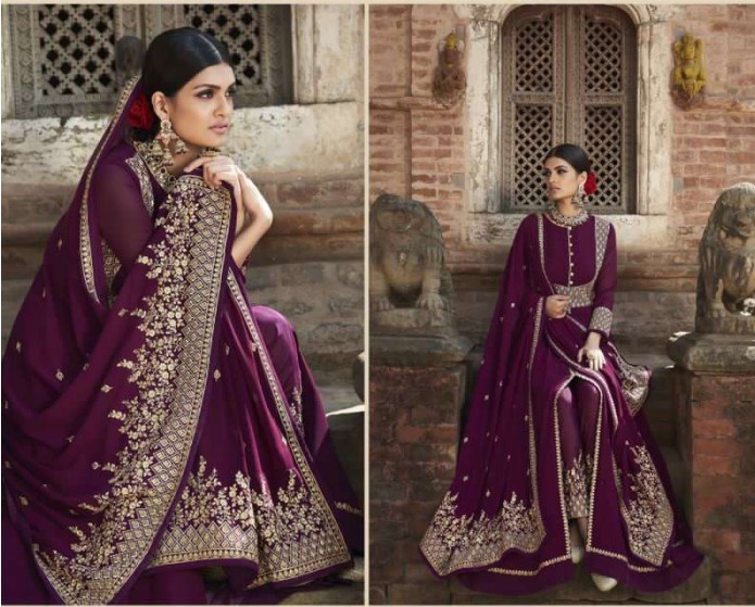
The delicacy of Details ❖ 22302 ❖