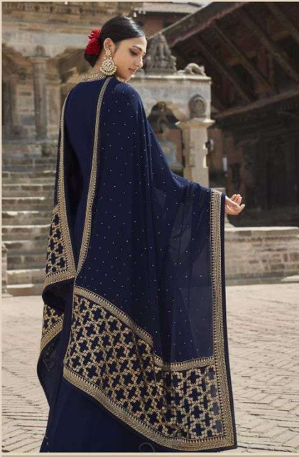
The Ecstasy of Velvet ❖ 22306 ❖