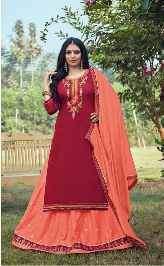
3633 CLASSIC TOUCH