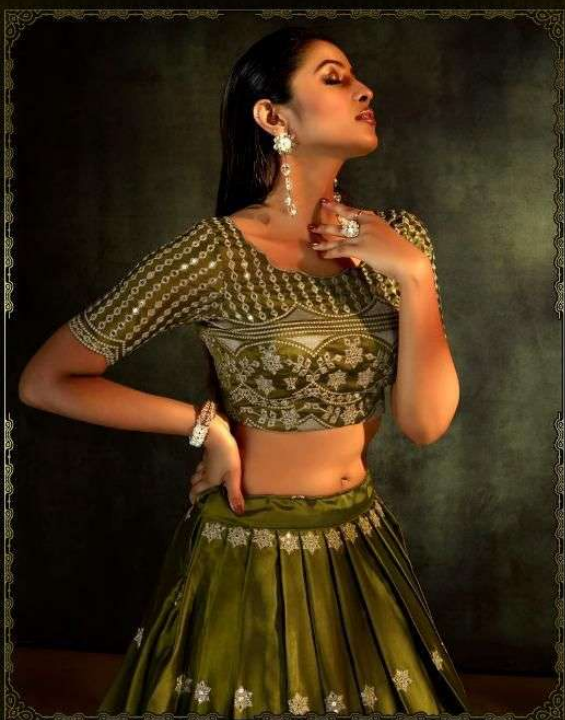
celina An ecstasy of timeless style.