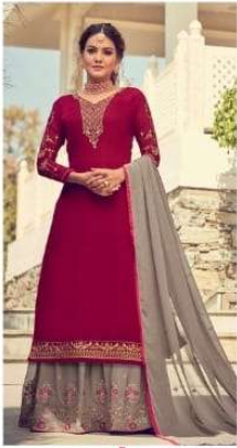
CODE \ 7304