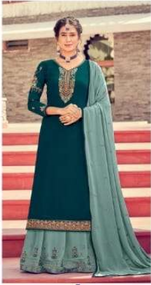
CODE \ 7301