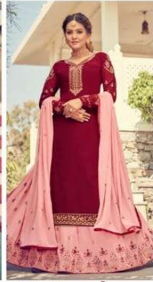
CODE \ 7302