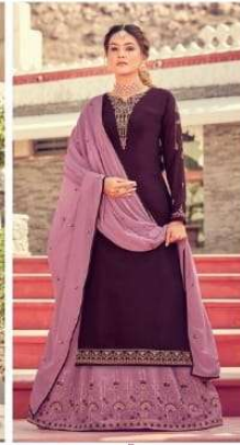
CODE \ 7306