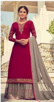
CODE \ 7304