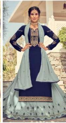
CODE \ 7305