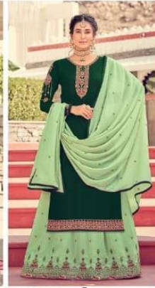
CODE \ 7303