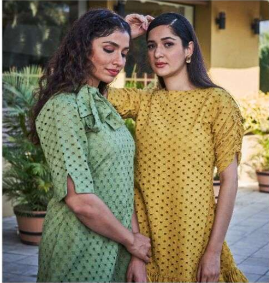
Style have to be created. And they're created by looking at what trend is in, say, the fashion industry - what color's hot right now.