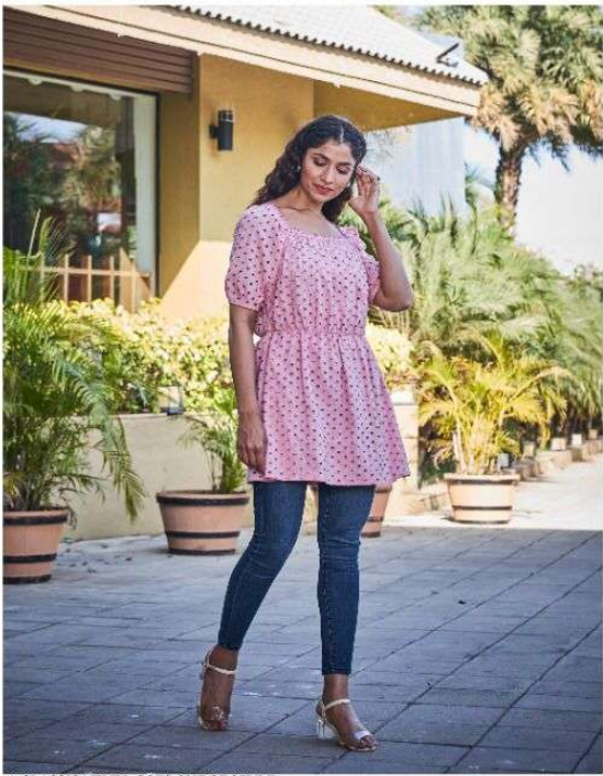
A CLASSIC NEVER GOES OUT OF STYLE