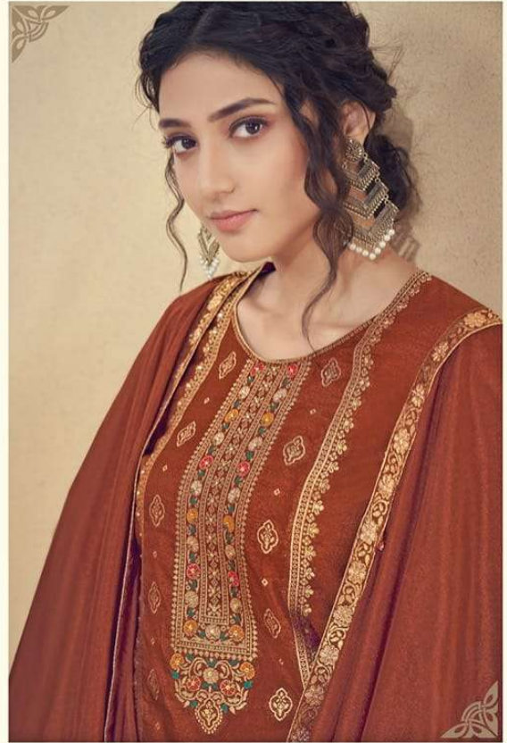
EFFORTLESS CALIBRE OF CREATIVITY WHICH FEATURES THE BEAUTY IN A PERSON WITH BEAUTIFUL GARMENT.