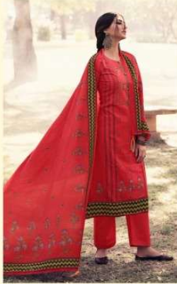
• 1004 •