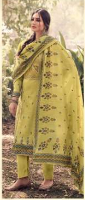
• 1001 •