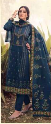
• 1002 •