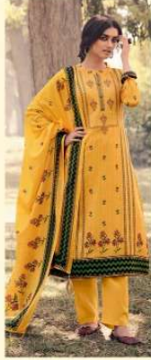
• 1003 •