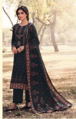
• 1005 •