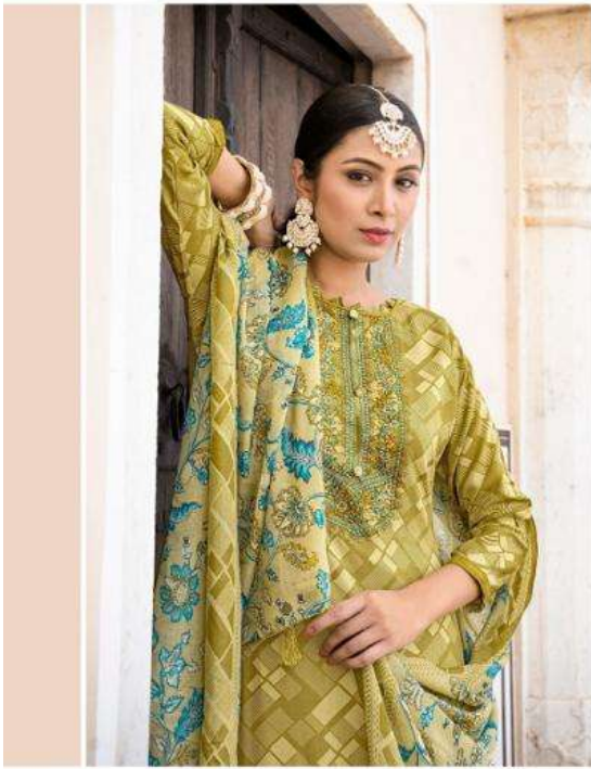
Delicate HOW BEAUTIFUL IS SHE