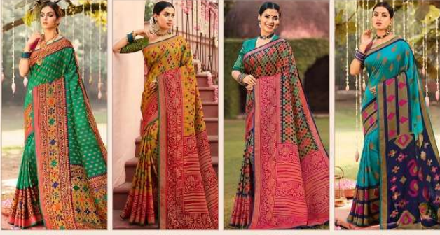
• 1901 • • 1902 • • 1903 • • 1904 •