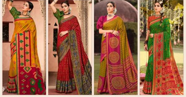
• 1909 • • 1910 • • 1911 • • 1912 •