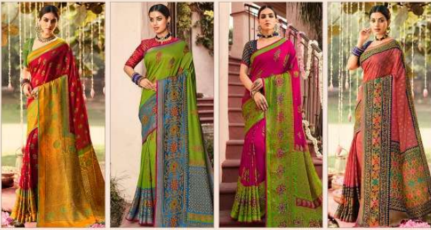
• 1905 • • 1906 • • 1907 • • 1908 •