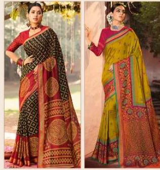
• 1913 • • 1914 •