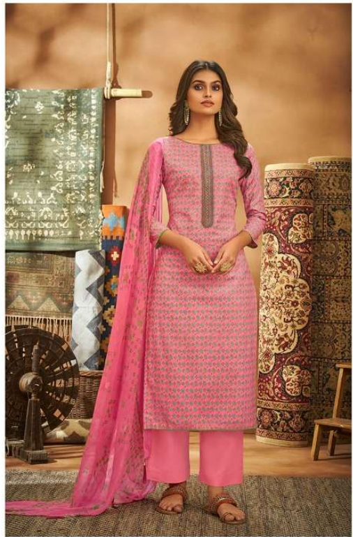
update your look with bright colors PALAK-719