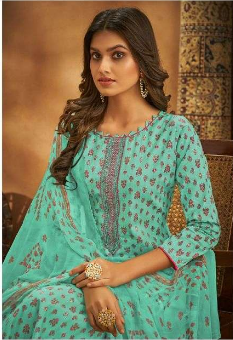
this season celebrate the magnificent in you. PALAK-712