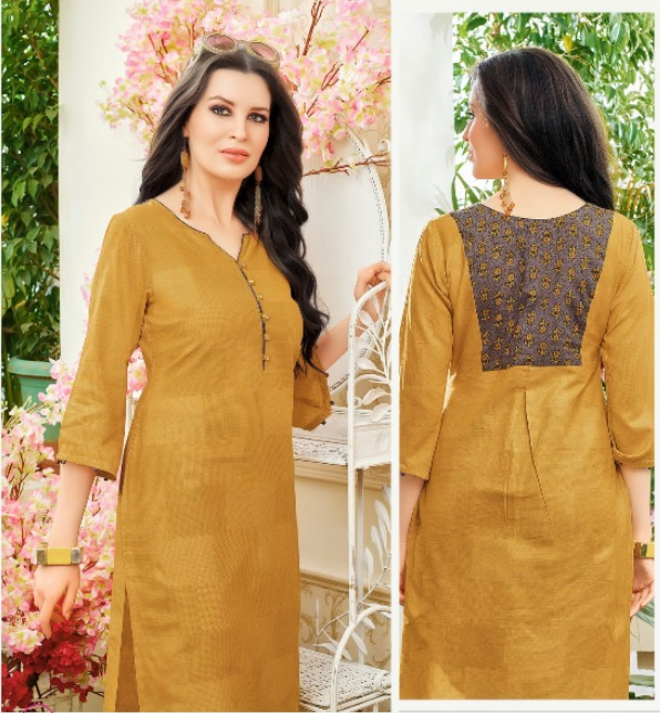
vini CODE: C-9005

YOUR EYES WILL LEAD YOUR WAY AS YOU STROLL ACROSS IN AN OUTFIT FROM THE NEW BRIDGE CROSS COLLECTION CELEBRATE YOUR CLASSY MOM IN THE FINEST OF WAYS