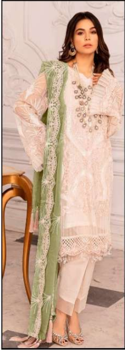
D - 1028 B