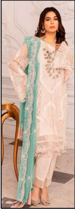
D - 1028 A