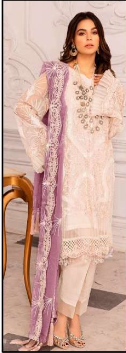
D - 1028 C