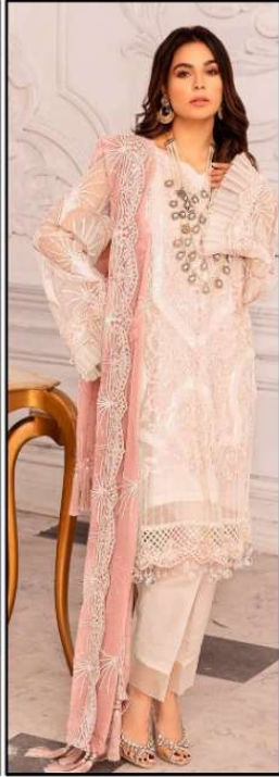
D - 1028 D