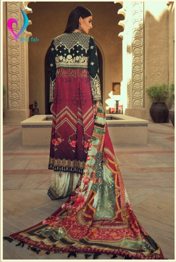
D. No: -1001