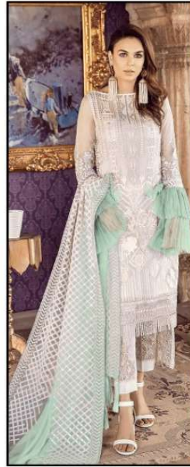
D.NO. 1032 D