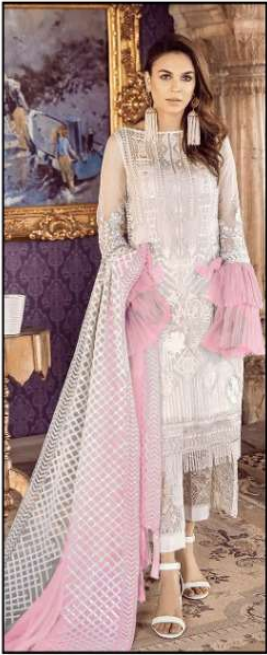
D.NO. 1032 A