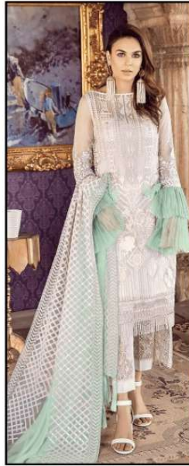
D.NO. 1032 D