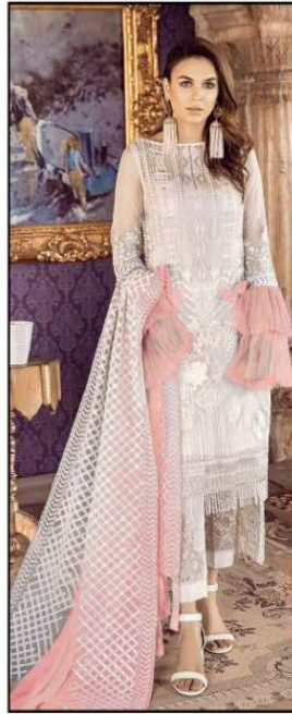
D.NO. 1032 C