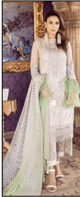
D.NO. 1032 B