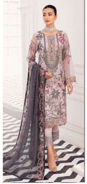
DESIGN - 519-D