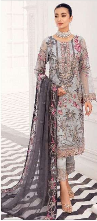
DESIGN - 519-A