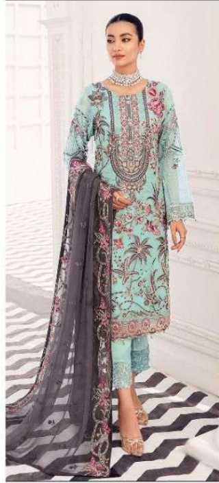
DESIGN - 519-B