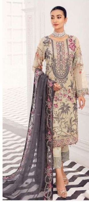
DESIGN - 519-C