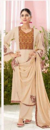
D.No.1005 • ❁ •