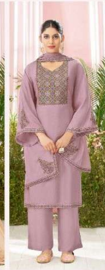
D.No.1006 • ❁ •