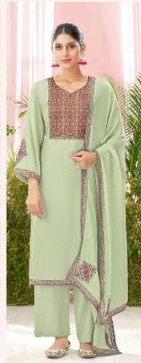
D.No.1003 • ❁ •