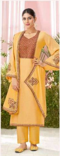
D.No.1001 • ❁ •