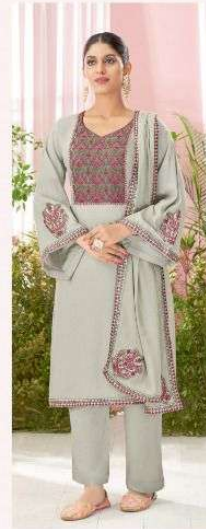
D.No.1004 • ❁ •