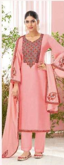
D.No.1002 • ❁ •