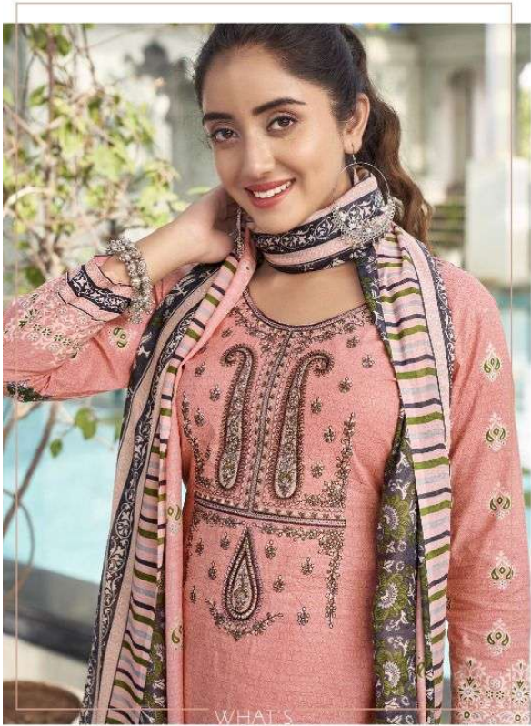
WHAT'S NEW "Style is something each of us already has, all we need to do find it."