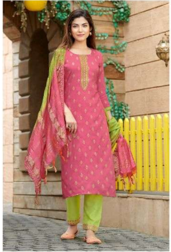
D. NO- 3002