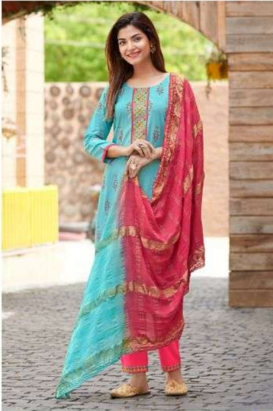
D. NO- 3005