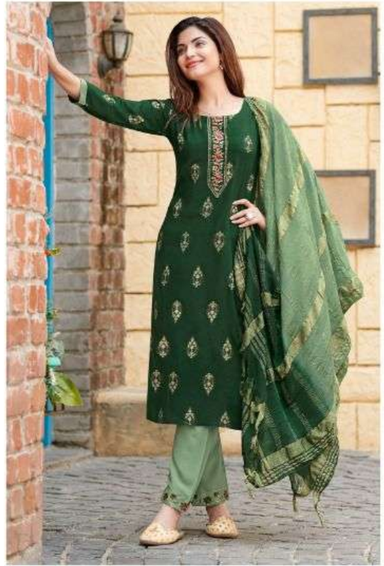
D. NO- 3004