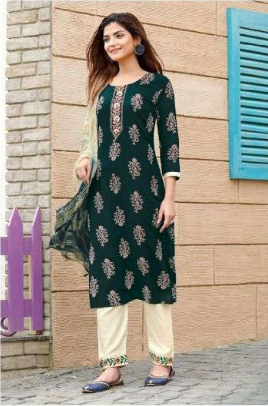
D. NO- 3001