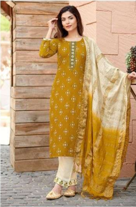
D. NO- 3003