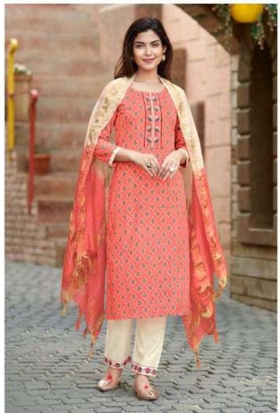
D. NO- 3008