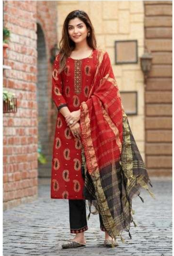
D. NO- 3006