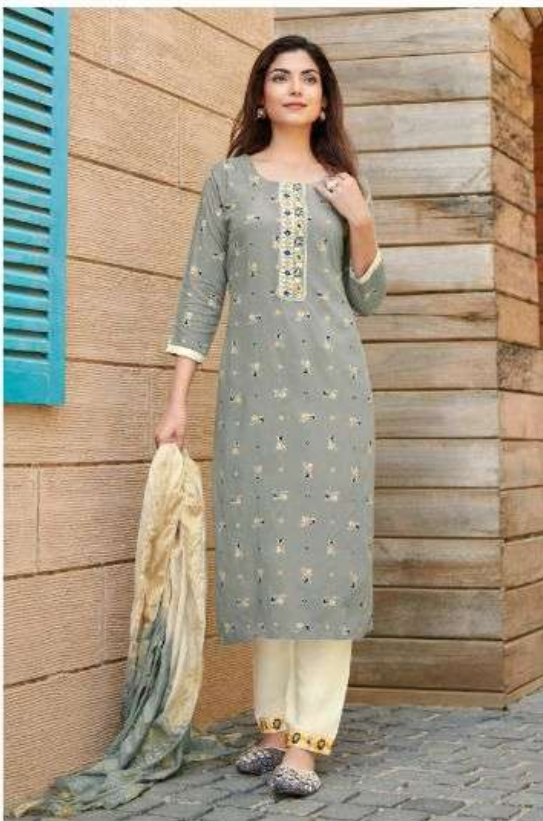
D. NO- 3007