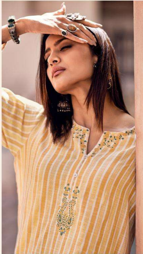
SV:14 Keep it simple