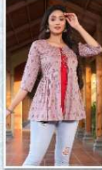
D No : 1006