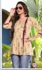
D No : 1008