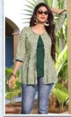
D No : 1005