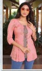
D No : 1007