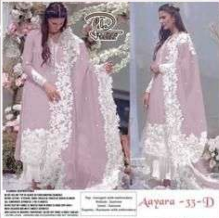
Aayara - 33-D