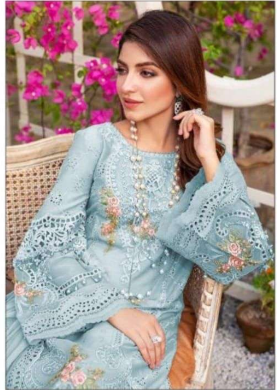
TOP : CEMBRIC COTTON DUPATTA : CHINON BOTTOM : POLYSTER COTTON