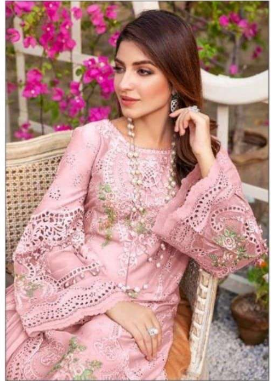
TOP : CEMBRIC COTTON DUPATTA : CHINON BOTTOM : POLYSTER COTTON