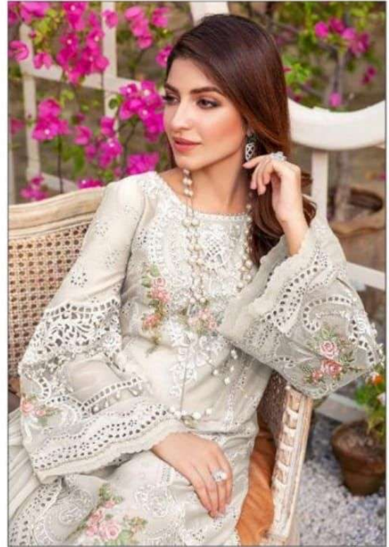
TOP : CEMBRIC COTTON DUPATTA : CHINON BOTTOM : POLYSTER COTTON