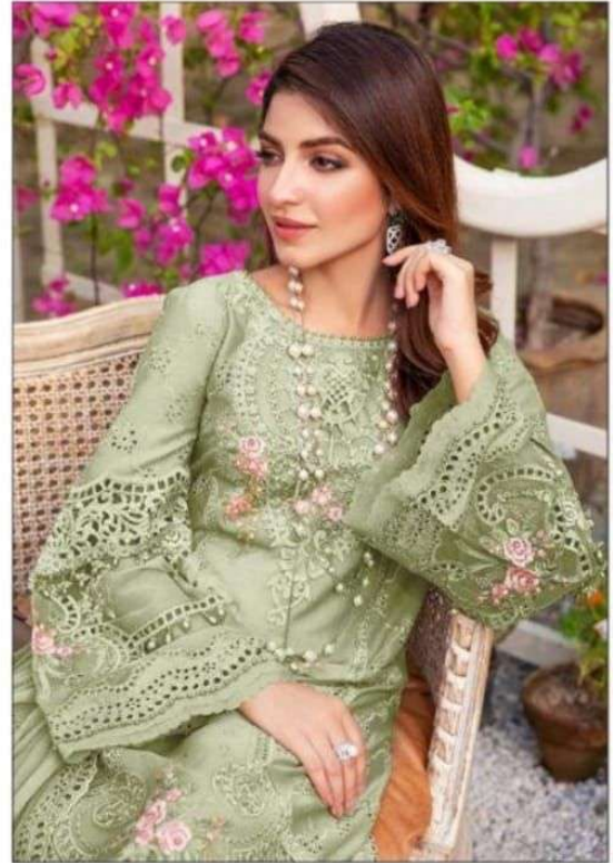
TOP : CEMBRIC COTTON DUPATTA : CHINON BOTTOM : POLYSTER COTTON