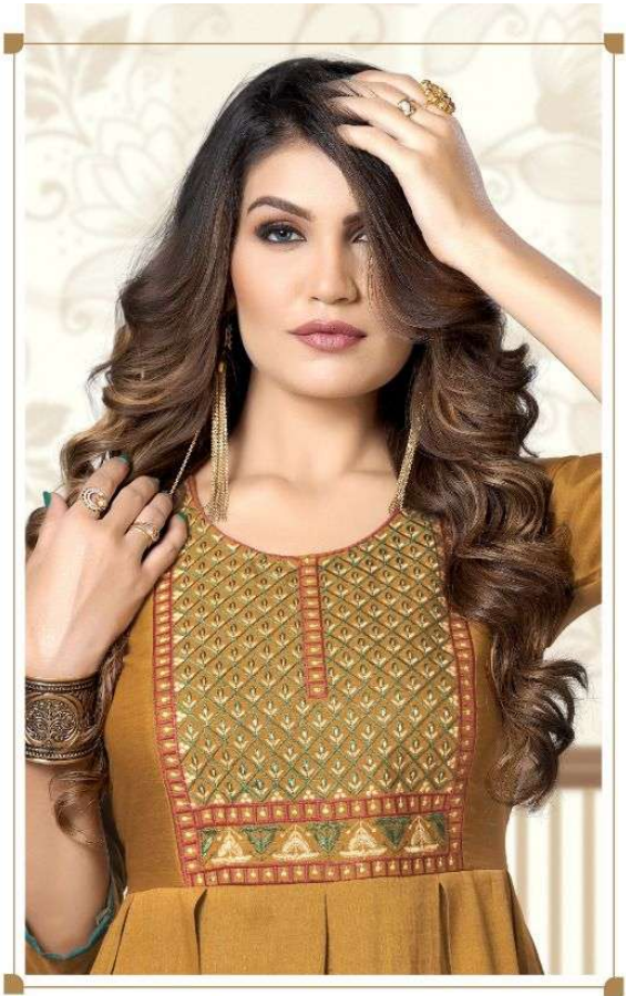
ETHNIC SENSE Turn every head your way as you stroll across in an outfit from the new gorgeous collection, celebrate your classy side with this perfect concoction of chic style