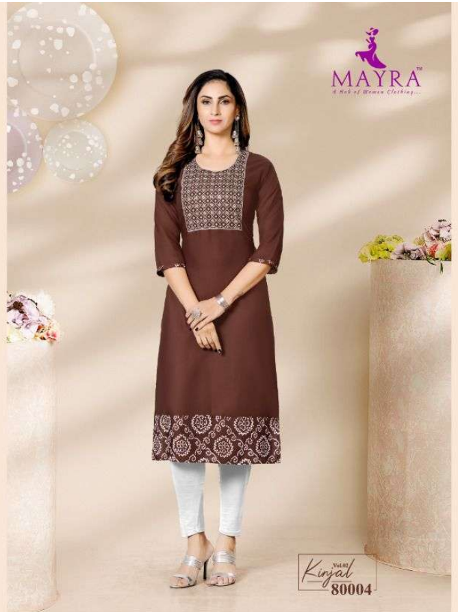
this stands as a classic example of the attire that will make everybody fall head over heels in love with fashion. a piece that makes a statement without having to say a word