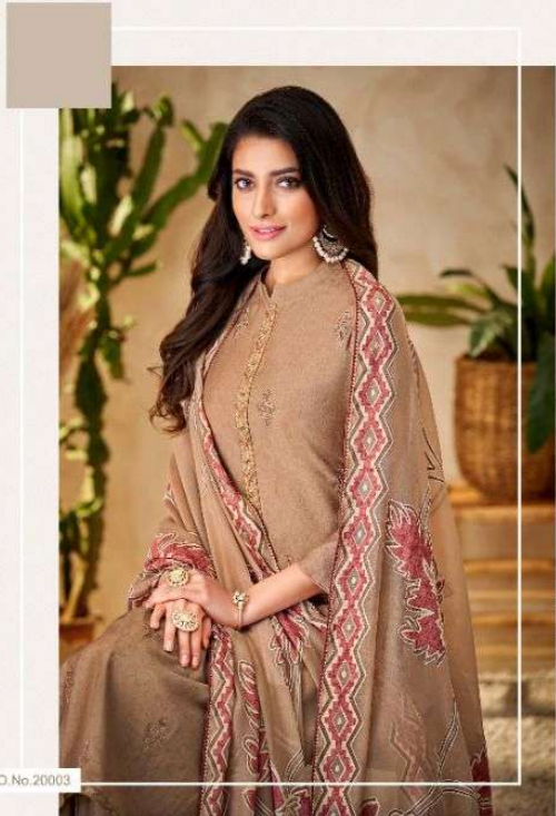
D No. 20003