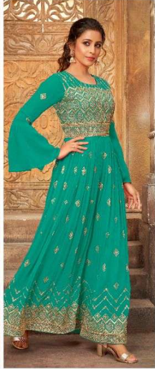
D.NO. 4052 ~*~*~*~*