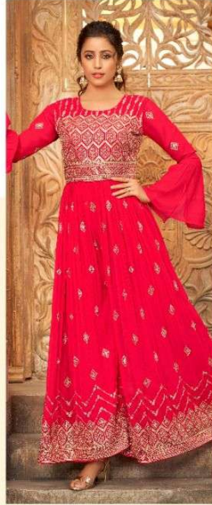
D.NO. 4053 ~*~*~*~*