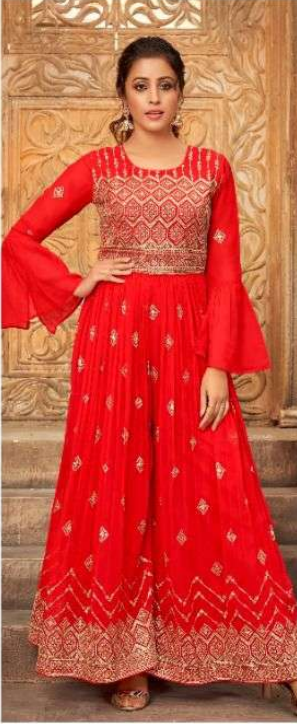
D.NO. 4051 ~*~*~*~*