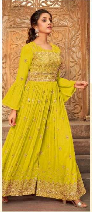
D.NO. 4054 ~*~*~*~*