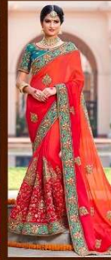
|| 604 ||