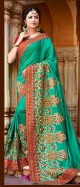
|| 704 ||