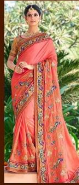
|| 601 ||