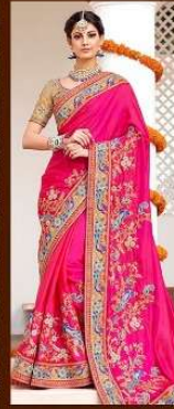
|| 602 ||