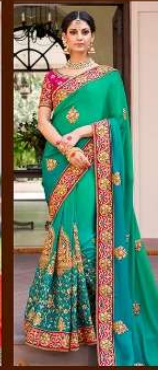
|| 605 ||