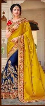
|| 702 ||