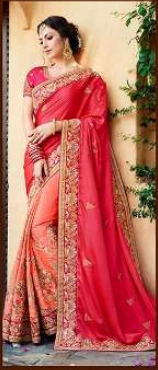
|| 701 ||