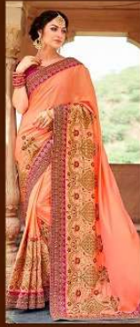
|| 703 ||