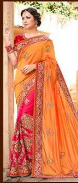
|| 711 ||