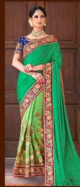
|| 610 ||