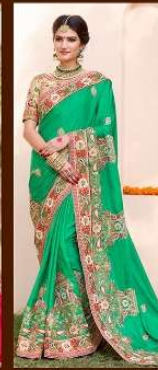
|| 612 ||