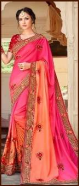
|| 705 ||