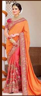
|| 609 ||