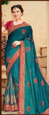
|| 706 ||