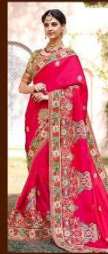
|| 611 ||