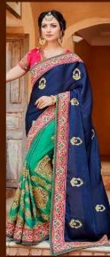
|| 712 ||