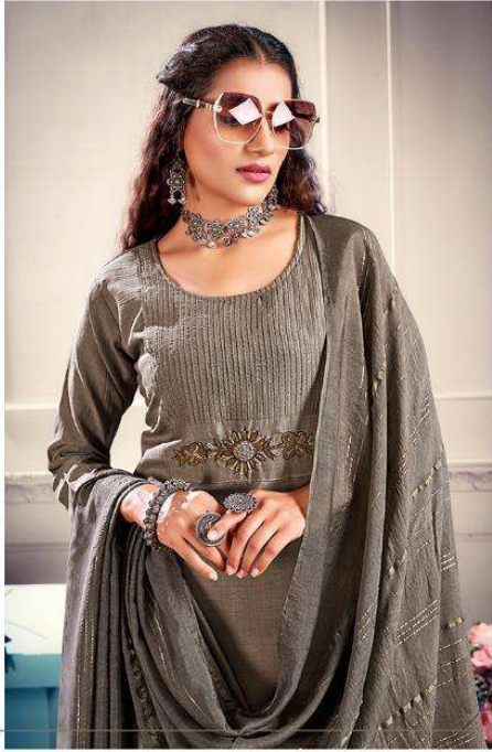
D.no . 1001