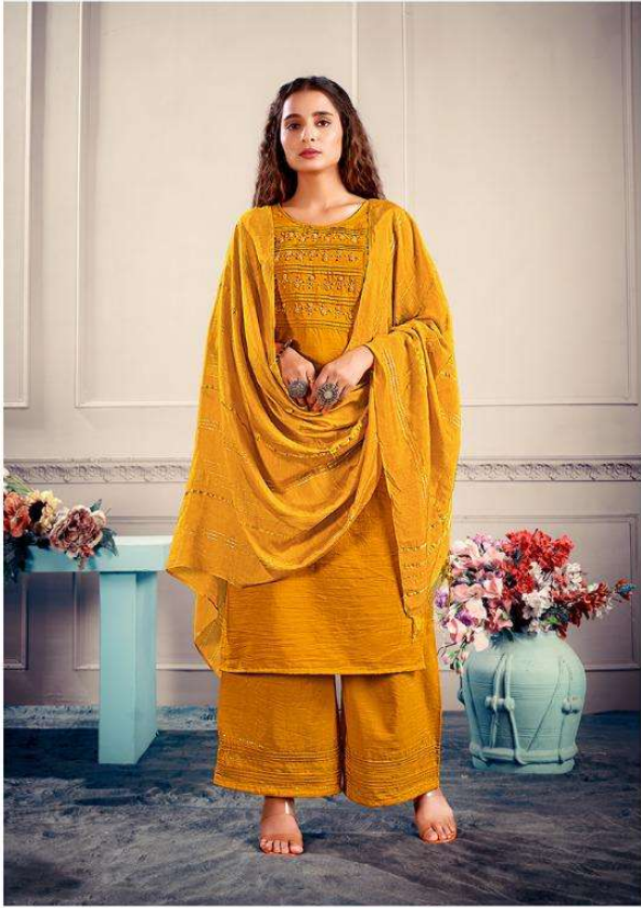
D.no . 1002