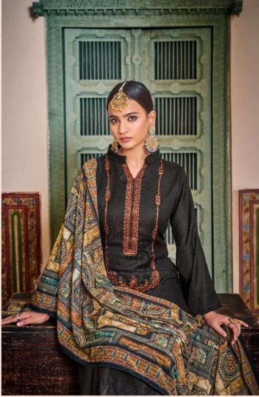
Celebrate IN STYLE # 10005