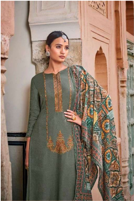
Stunning DESIGN # 10001