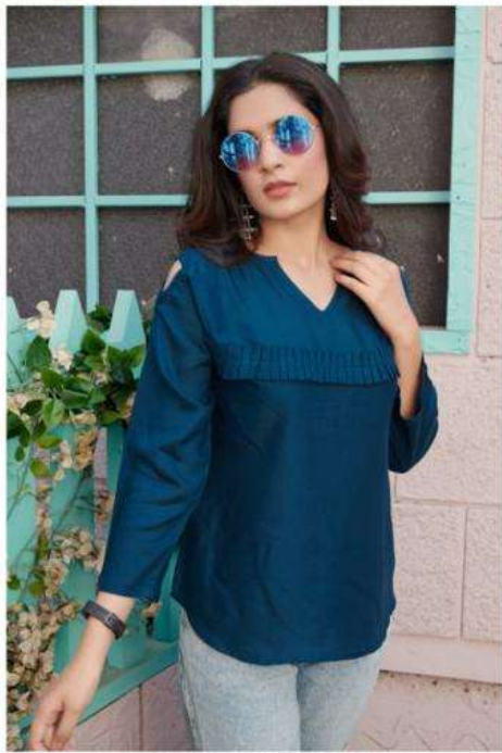
REINCARNATING D E S I R E DESIGNER: KAJRI STYLE REINCARNATING DESIRE D.NO.2001