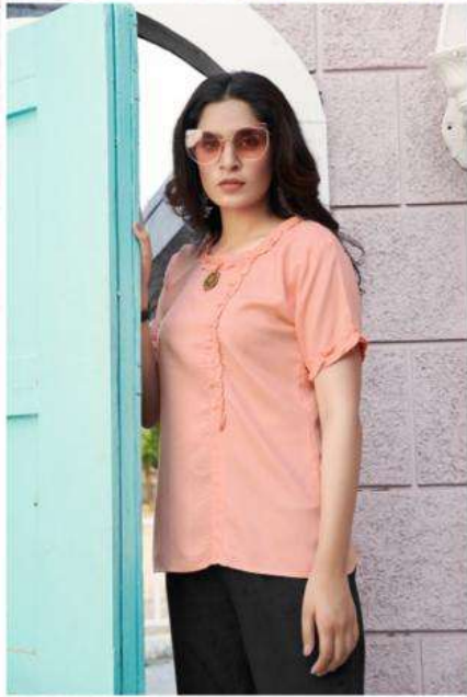
PLEASING DESIRE WOMEN'S WEAR DESIGNER WEAR DESIGNER WEAR DESIGNER WEAR DESIGNER WEAR DNO 2002