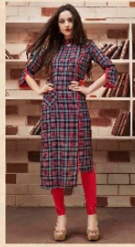
DESIGN NO. 1002