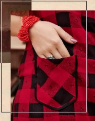
DESIGN NO. 1004

DREAM A WORD CAN GIVE INSPIRATION TO OUR DESIGNERS TO CREATE EXCELLENT DESIGNS FOR BEAUTIFUL LADY.