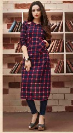
DESIGN NO. 1009