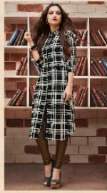
DESIGN NO. 1001