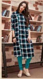
DESIGN NO. 1010