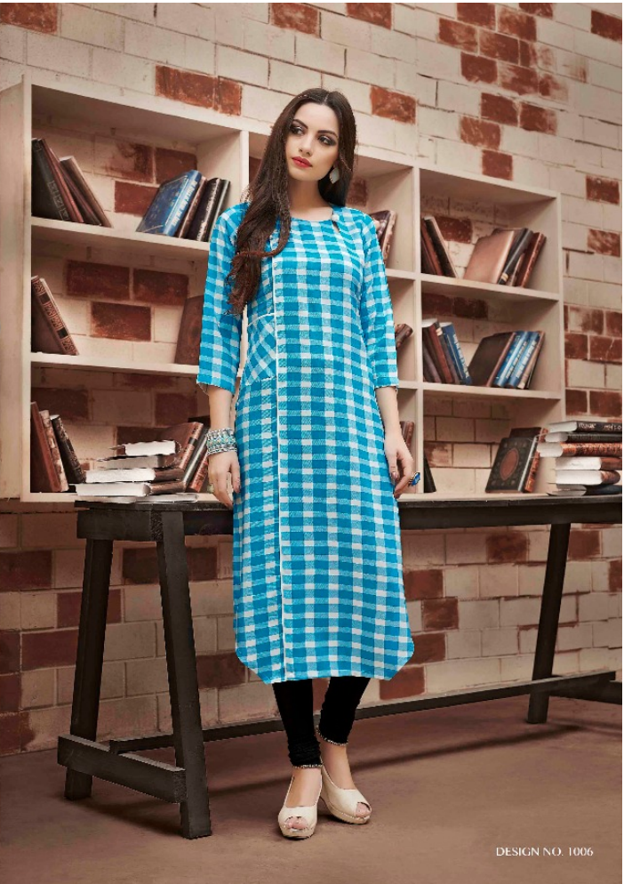
DESIGN NO. 1006