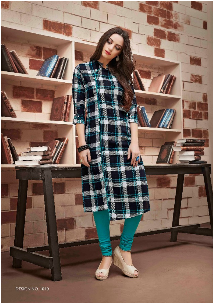
DESIGN NO. 1010