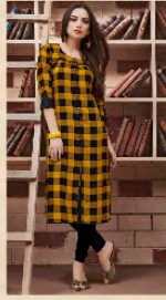
DESIGN NO. 1005