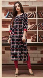
DESIGN NO. 1007