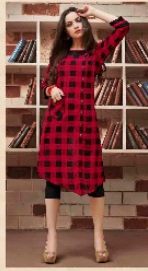
DESIGN NO. 1004