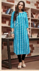
DESIGN NO. 1006