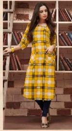
DESIGN NO. 1008