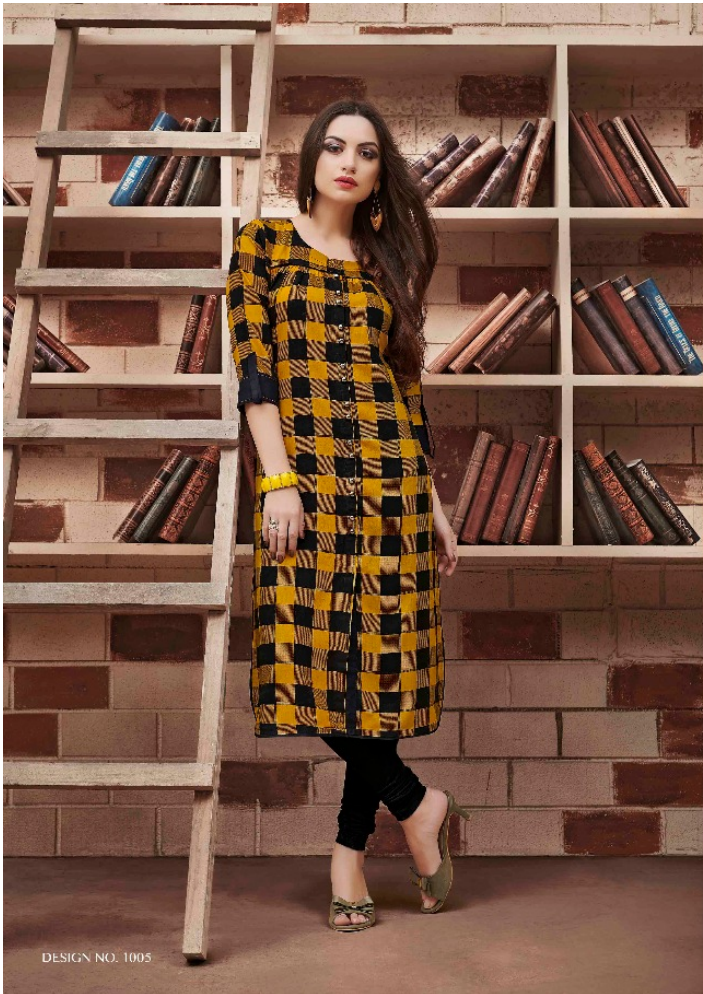
DESIGN NO. 1005