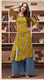
DESIGN NO. 1003