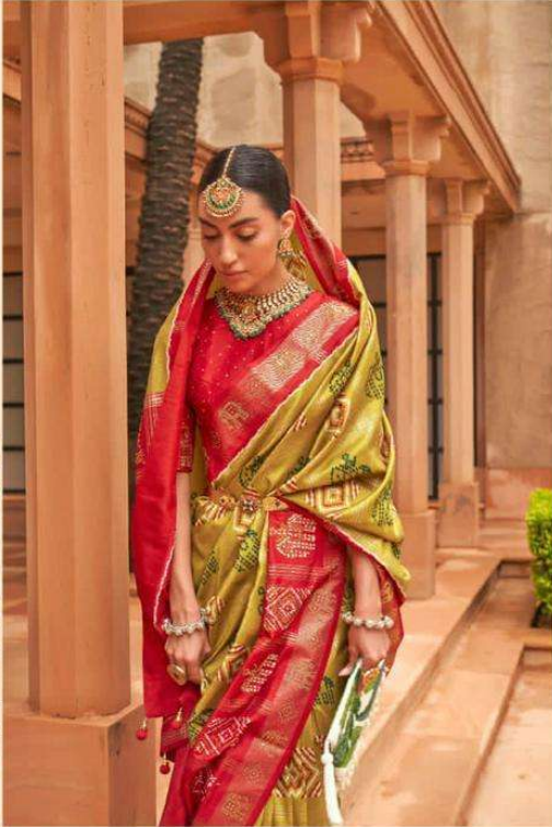
Indian Heritage Patola

HOW DO YOU PERCEIVE FASHION IN PEOPLE'S DAILY LIVES? WHAT ARE THE UP-BREAKING TRENDS THIS SEASON?