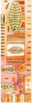
Indian Heritage Patola

HOW DO YOU PERCEIVE FASHION IN YOUR OWN COUNTRY? LIVE IT TIGHT AND TO THE BARRICADES TRENDS THIS SEASON.