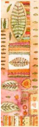
Indian Heritage Patola

HOW DO YOU PERCEIVE EXCELLENCE IN PROFESION & IN LIFE? SHEAT AGE TO TOP BANARASI THREADS THIS SEASON.