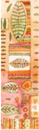
Indian Heritage Patola

HOW DO YOU PERCEIVE FASHION? POPULARITY HASN'T LURED THAT ARE TO OF WALKING TRENDS? THE SEARCH.