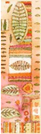
Indian Heritage Patola

HOW DO YOU PERCEIVE YOUR OWN PROPER DAILY LIVES? WHAT ARE TO OF BANARAS TREND? THE BRANCH