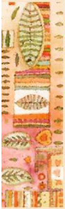
Indian Heritage Patola

HOW DO YOU PERCEIVE YOUR HUNTS POOR, THE DASH'S LOVE'S SPEAK AS TO THE BANARAS TRADITION THE MARCH