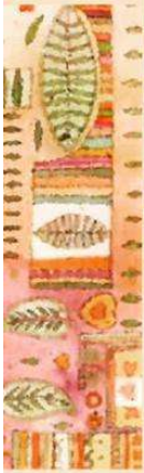
Indian Heritage Patola

हमारे देश की परम्पराओं का जड़भूत है। इसलिए हमें इसे सुरक्षित रखना है। इसलिए हमें इसे सुरक्षित रखना है। इसलिए हमें इसे सुरक्षित रखना है।