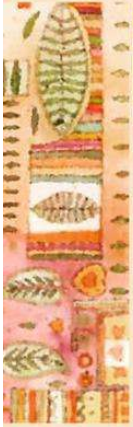
Indian Heritage Patola

HOW DO YOU PERCEIVE EXCELLENCE IN PROFESION & IN LIFE? SHEAT AGE TO TOP BANARASI THREADS THIS SEASON.