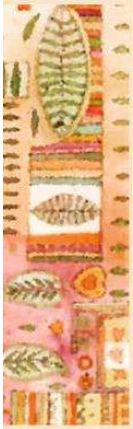
Indian Heritage Patola

HOW DO YOU PERCEIVE FASHION IN PROFANE DAILY LIFE? WHAT ARE THE BANGALAHI TRENDS THIS SEASON?