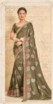
42713 Fabric : Khadi Silk