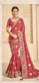
42709 Fabric : Khadi Silk