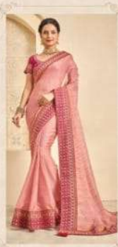
42707 Fabric : Patterned Organza