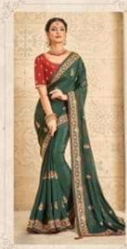
42708 Fabric : : Crepe Silk