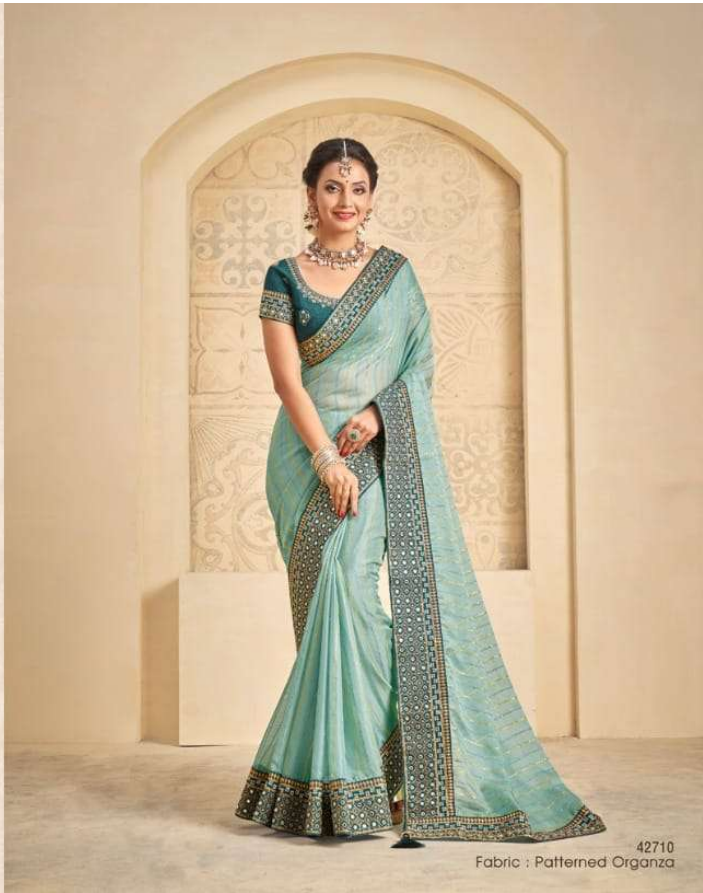
42710 Fabric : Patterned Organza