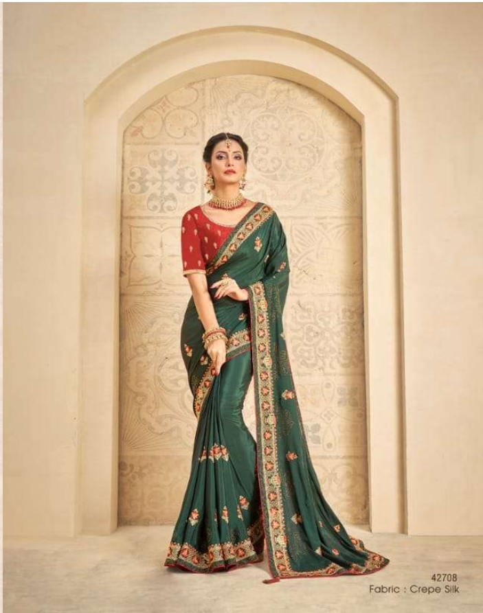
42708 Fabric : Crepe Silk