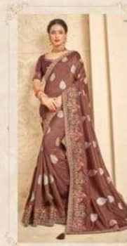
42711 Fabric : Khadi Silk