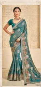
42706 Fabric : Khadi Silk