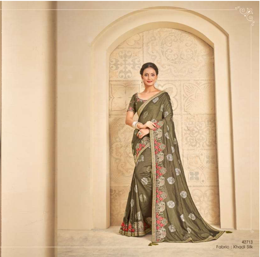
42713 Fabric : Khadi Silk