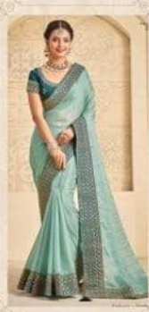
42710 Fabric : Patterned Organza