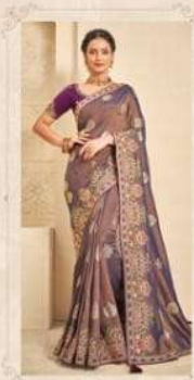
42705 Fabric : Khadi Silk