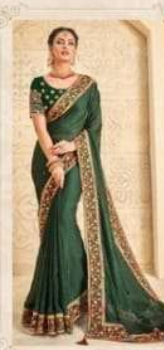
42712 Fabric : Satin Silk