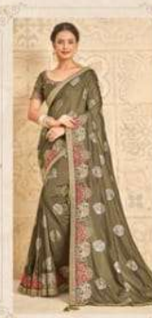
42713 Fabric : Khadi Silk