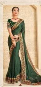
42712 Fabric : Satin Silk