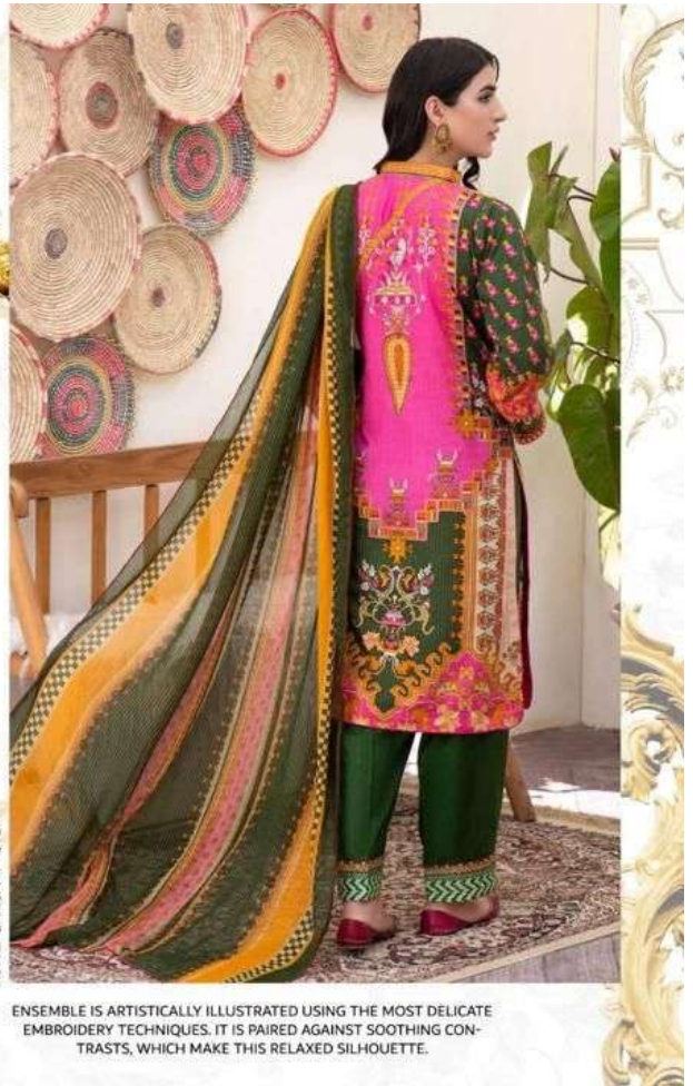
ENSEMBLE IS ARTISTICALLY ILLUSTRATED USING THE MOST DELICATE EMBROIDERY TECHNIQUES. IT IS PAIRED AGAINST SOOTHING CONTRASTS, WHICH MAKE THIS RELAXED SILHOUETTE.