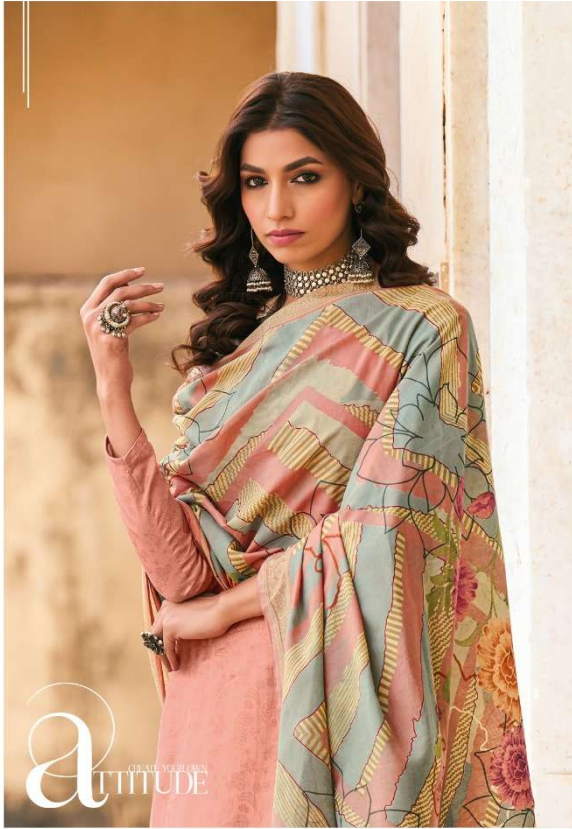
LOOK # 595