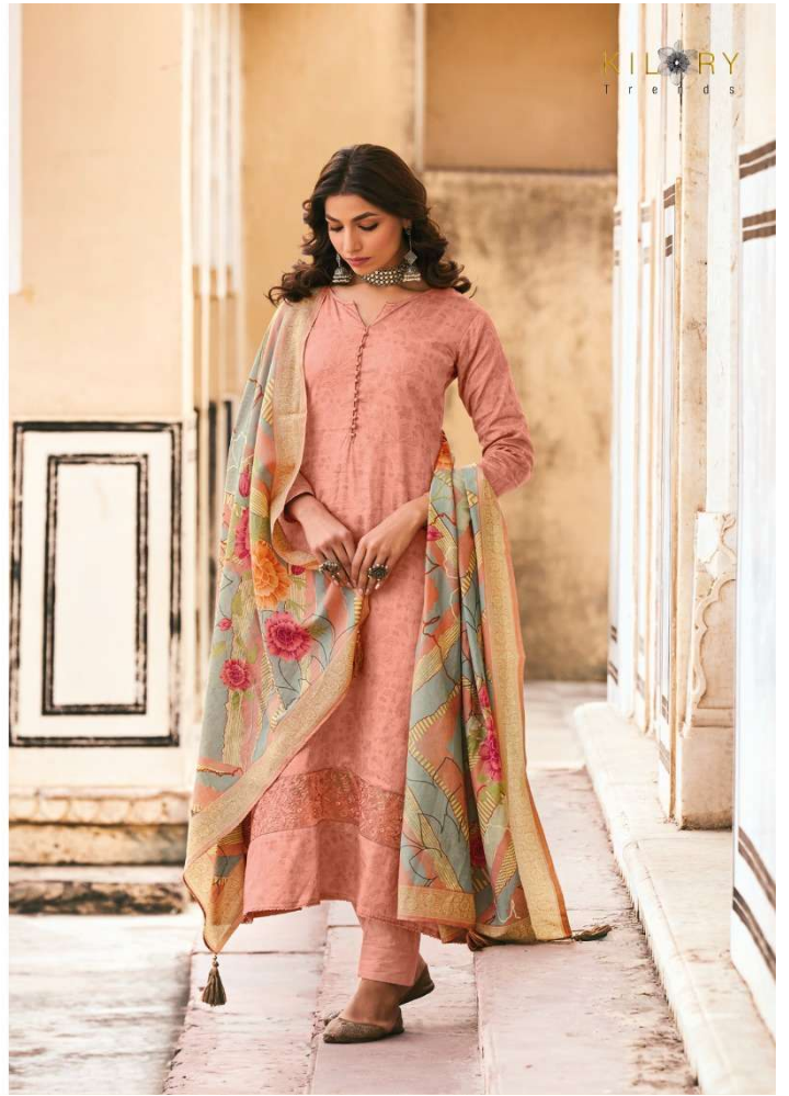
LOOK # 595