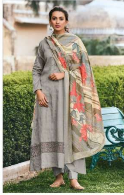
LOOK # 592