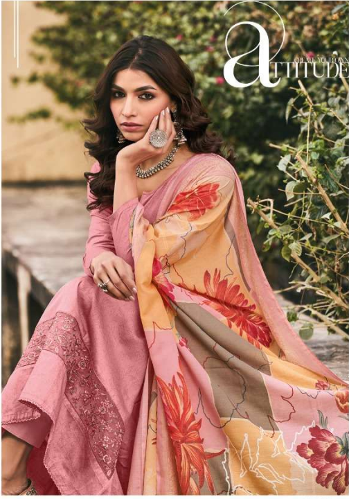
LOOK # 591