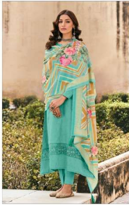
LOOK # 593