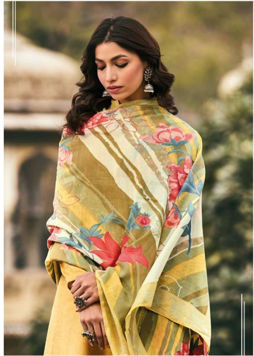
LOOK # 597