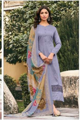
LOOK # 598