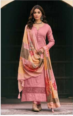
LOOK # 591