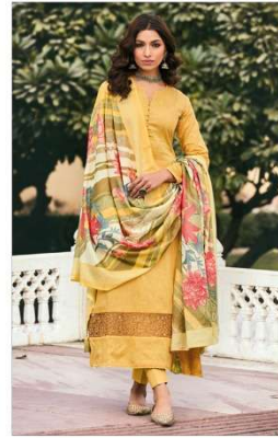
LOOK # 597