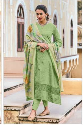
LOOK # 596