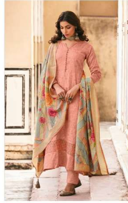
LOOK # 595