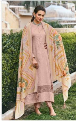
LOOK # 594