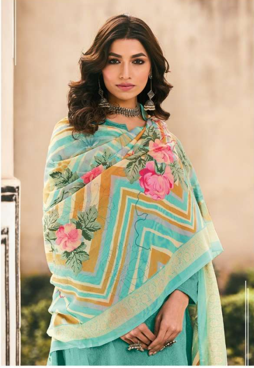
LOOK # 593