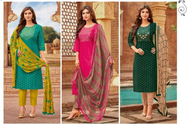
62007 ໂຊກຊຸມ 62008 ໂຊກຊຸມ 62009 ໂຊກຊຸມ