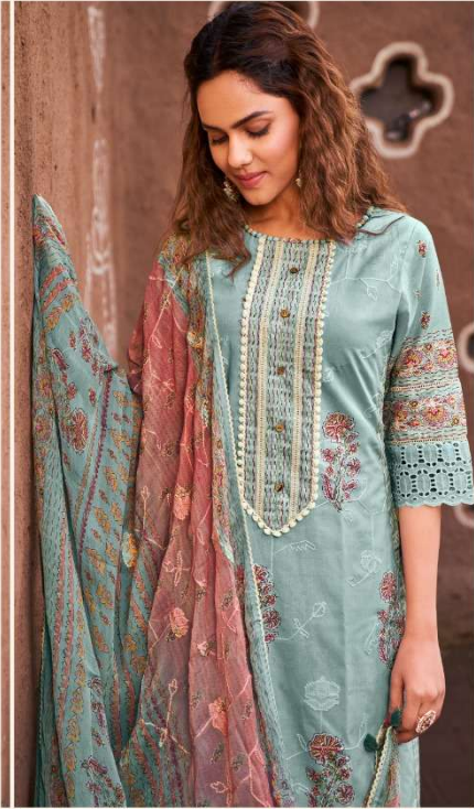
This season look up with some truly inspiring & elegantly 7797