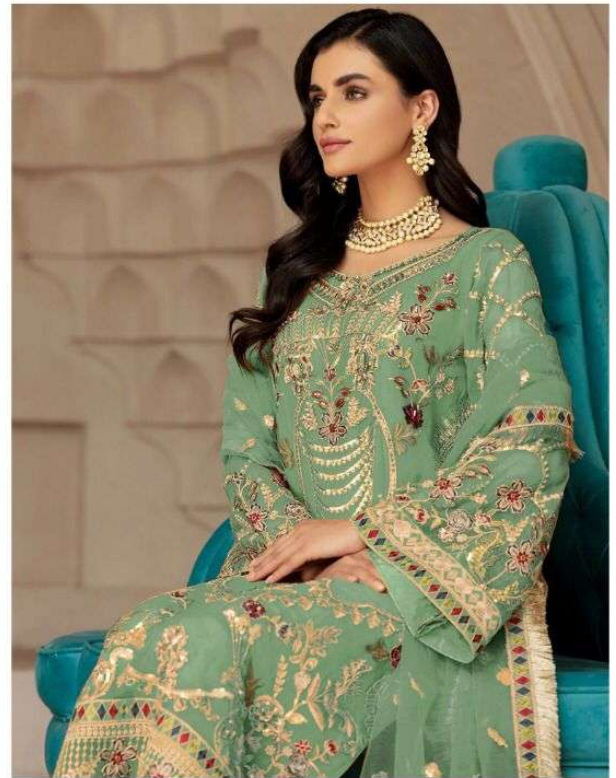
D.NO.130-B TOP:- GEORGETTE INNER:- SANTOON BOTTOM:- SANTOON DUPATTA:- NET