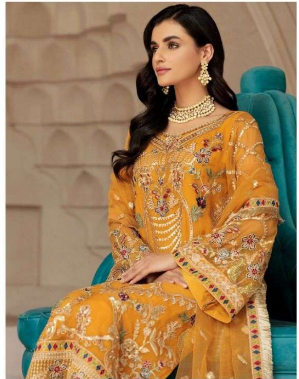
D.NO.130 TOP:- GEORGETTE INNER:- SANTOON BOTTOM:- SANTOON DUPATTA:- NET