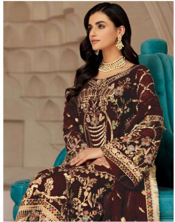
D.NO.130-C TOP:- GEORGETTE INNER:- SANTOON BOTTOM:- SANTOON+ PATCHWORK DUPATTA:- NAZNEEN