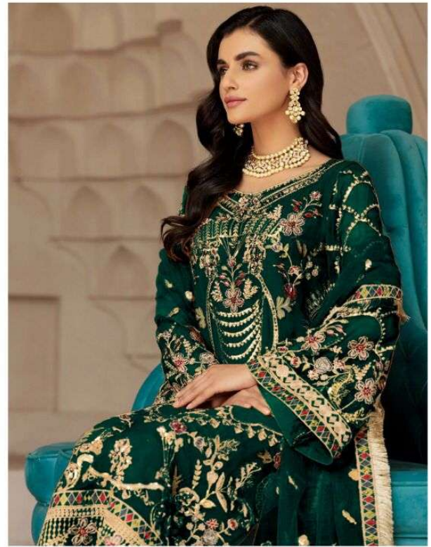
D.NO.130-A TOP:- GEORGETTE INNER:- SANTOON BOTTOM:- SANTOON+ PATCHWORK DUPATTA:- NAZNEEN