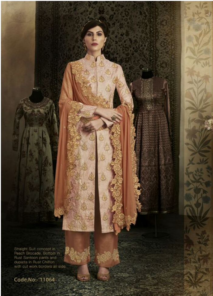
Straight Suit concept in Peach Brocade. Bottom in Rust Santoon pants and dupatta in Rust Chiffon with cut work borders all side.