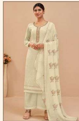
❁ 2046 D ❁