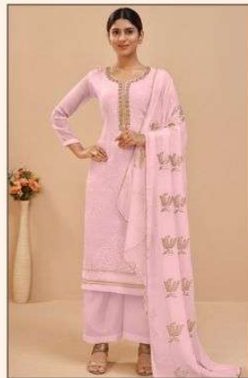
❁ 2046 C ❁