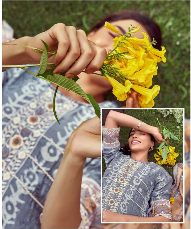
The glamour is something which will fulfill all the requirement for glossy & trendy look