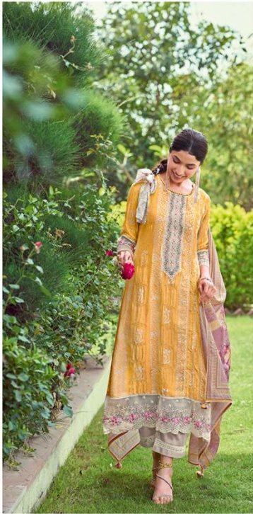
The collection was a perfect blend of Indian silhouettes & contemporary style.