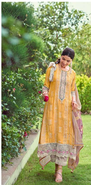
The collection was a perfect blend of Indian silhouettes & contemporary style.