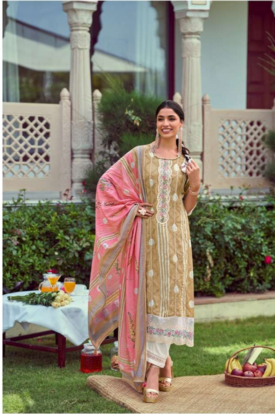
Different cultures come together in a tribute to fashion's biggest moment this season.