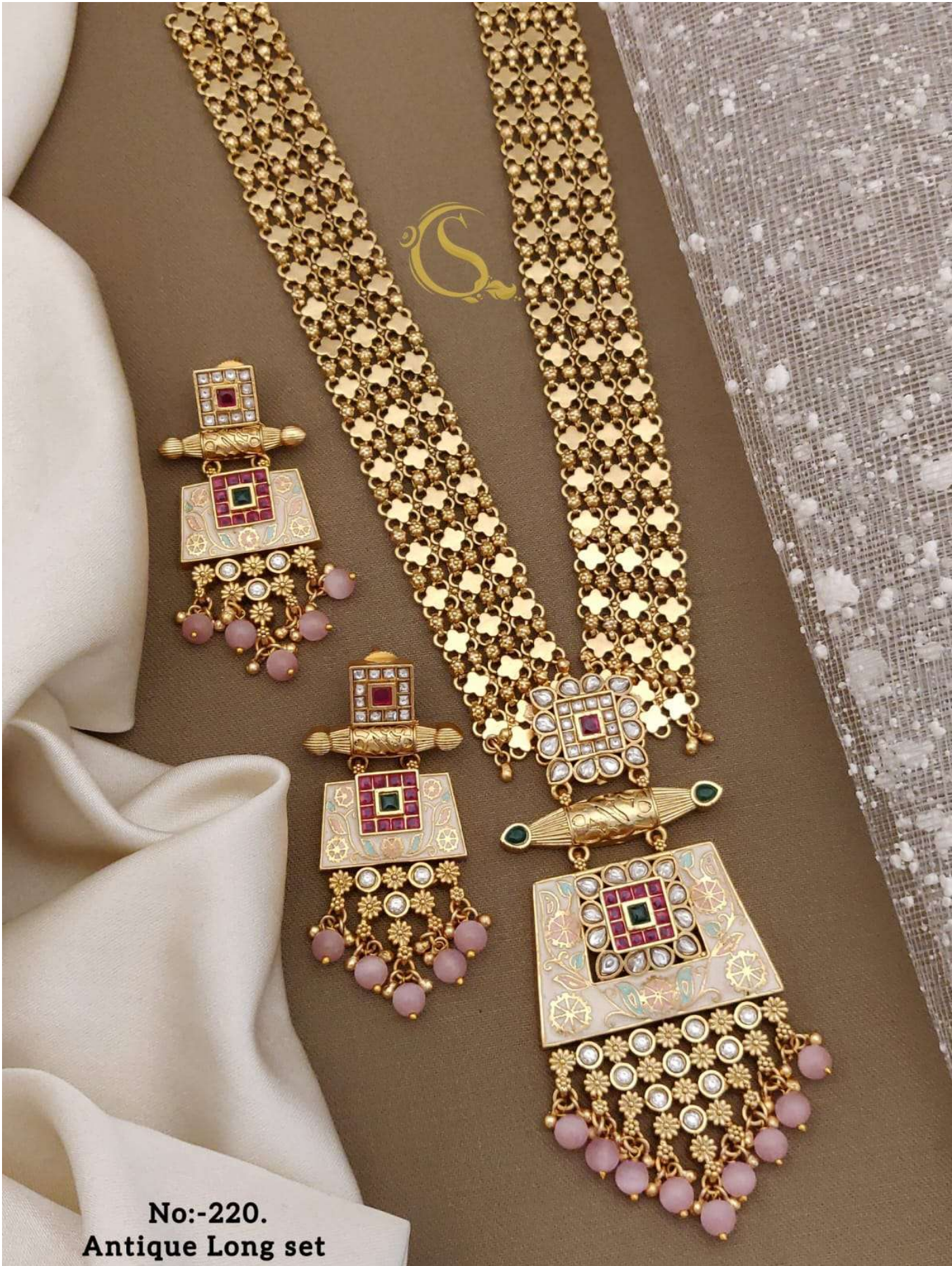
No:-220. Antique Long set