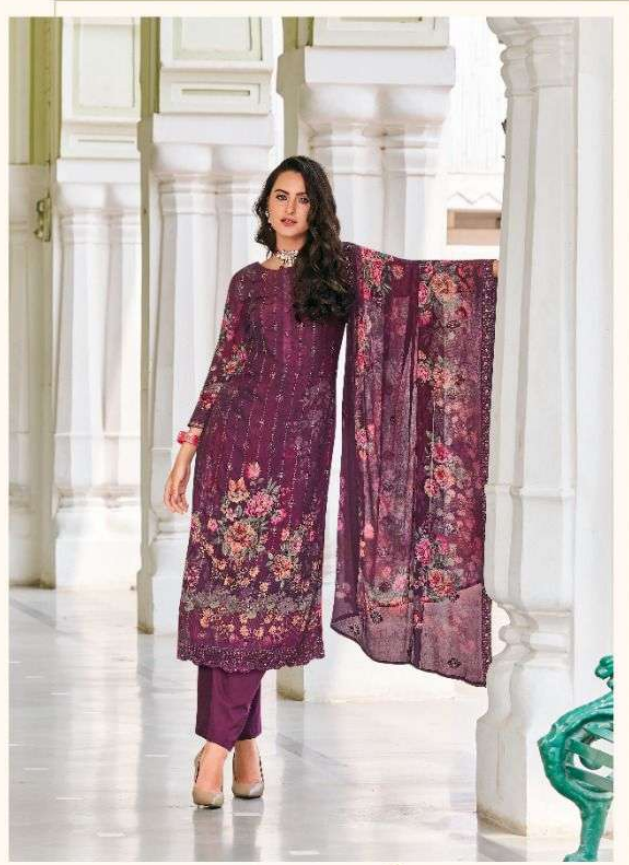
1089 The Best and Latest in Fashion