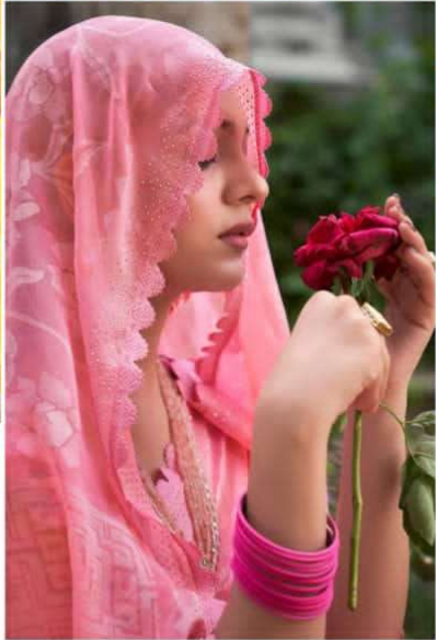
THE NEW ARRIVAL SHOWS HEALING AND SAVES YOUR ART OF STYLE AS THE CULTURE OF LOVE AND MOURNING THROUGH THE GENTLESTAL MARCH OF FEMINITY