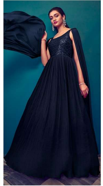
CODE + 4964