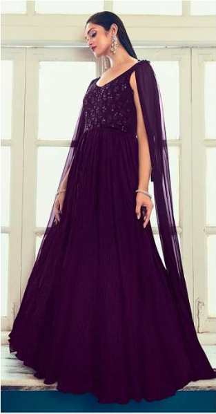
CODE + 4961