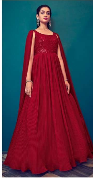
CODE + 4962