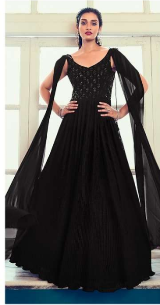
CODE + 4963