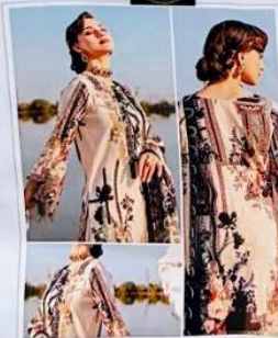
• QUEEN COURT VOL-1 SINGLES HIT DESIGN