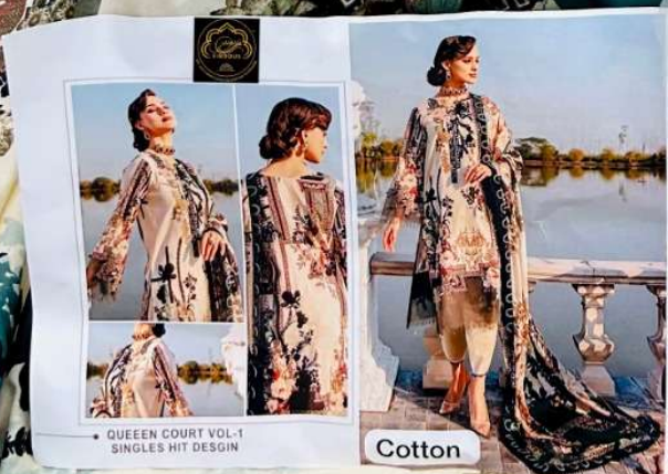
• QUEEN COURT VOL-1 SINGLES HIT DESIGN