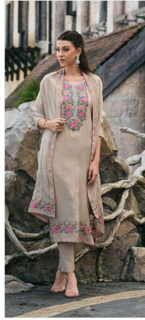
1203 | URFI