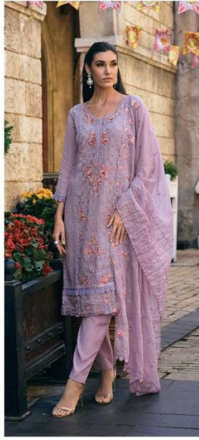
1202 | URFI